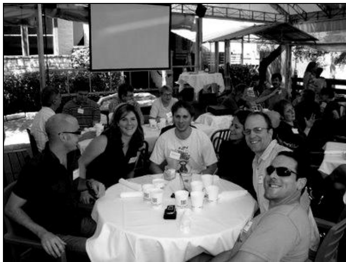
August 2008 Meeting

"Zymurgy: The Art and Science of Making Beer"