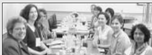
WCC Dutch Treat Lunch at 2004 Fall ACS Meeting in Philadelphia

The WCC hosts a "Dutch treat" lunch at every national ACS meeting to encourage networking among local section women chemists committees (LSWCC). The conversation is lively, with opportunity for informal interaction between chemical professionals and students. Please join the WCC on Sunday, March 13, 2005, at the San Diego Marriott Yacht Club for "Dutch treat" lunch and to learn more about WCC local activities.