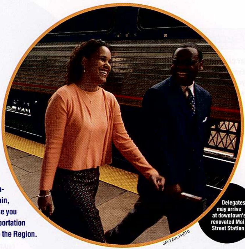
Delegates may arrive at downtown's renovated Main Street Station.

of Washington, D.C., and tucked between the Blue Ridge Mountains and the Atlantic coast, the Richmond Region boasts an ideal location for conventions and meetings. Traveling here by plane, train, motorcoach or automobile is a breeze. Once you arrive, take advantage of a variety of transportation providers to help you navigate the Region.